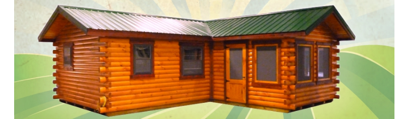
Shown with 12x24 Hunter & 10x10 Breezewood

Choose your two portable models and add $575 to connect them